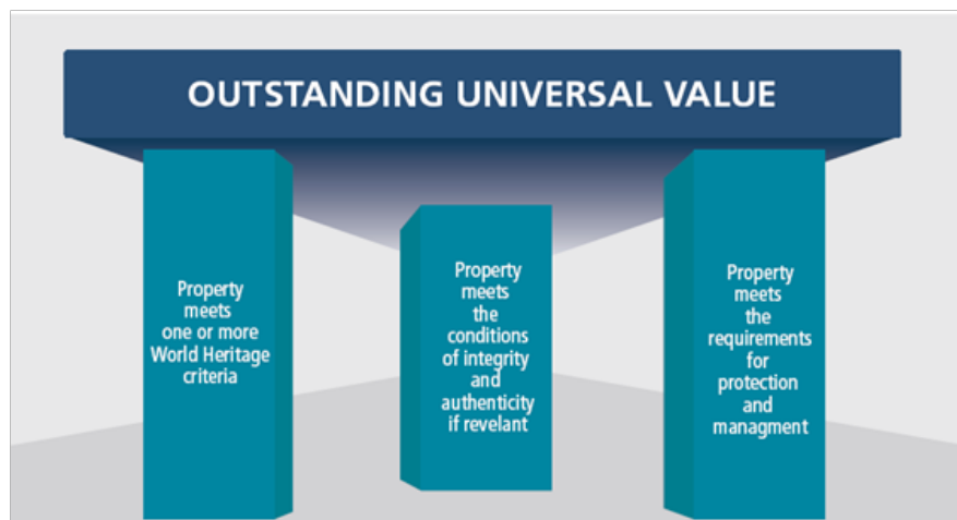
Figure 3: The three pillars of Outstanding Universal Value are reflected in the three main Conservation Outlook Assessment topics – values, threats, and protection and management